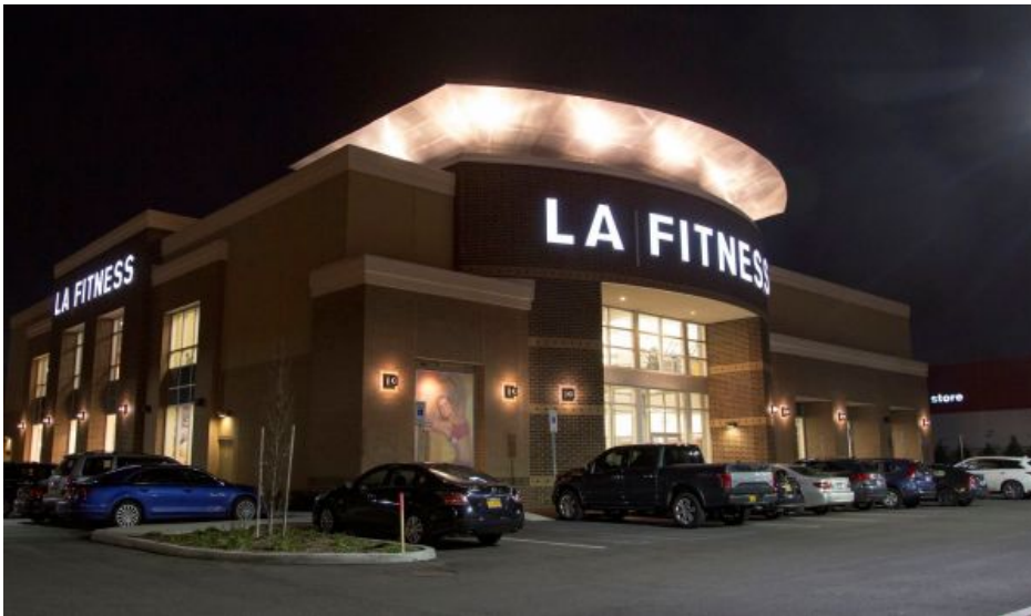
The LA Fitness sports club in Garden City Park where Nassau County health officials said two samples taken in the pool area tested positive for bacteria that cause Legionnaires' disease, shown on Thursday, Jan. 5, 2017.